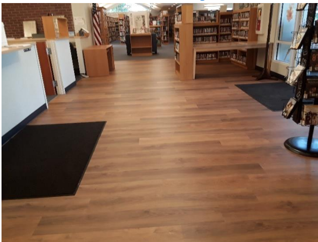
The new entryway

The theme for the 2024 calendar is "Remington, a Great Place to Live". You may enter pictures of animals, landscapes, or buildings, but please no people. I encourage you to get out this fall and start taking pictures. We hope to see photos from the different seasons. There will be a limit of 4 photos per person. Don't have a camera, use your cell phone. Rules will be posted on our website, www.rctpl.lib.in.us .