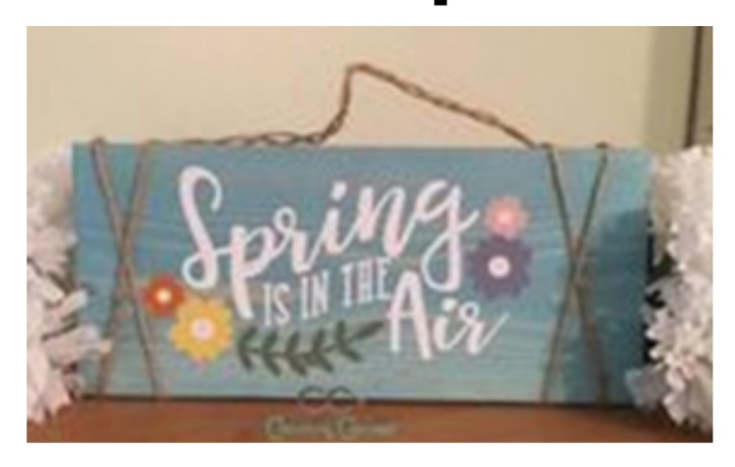
Register by April 13 Cost $5

Sign Painting Party Monday, April 20 6:00-8:00pm